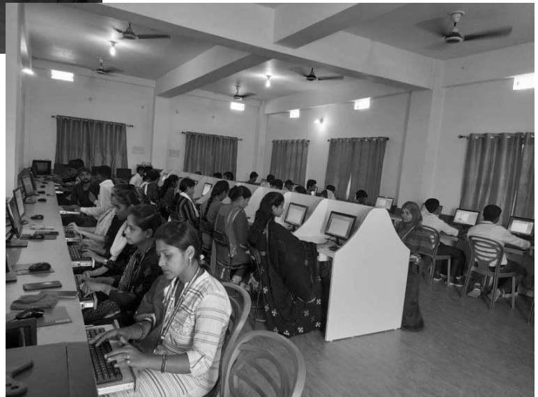
STUDENTS USING ICT RESOURCE CENTRE